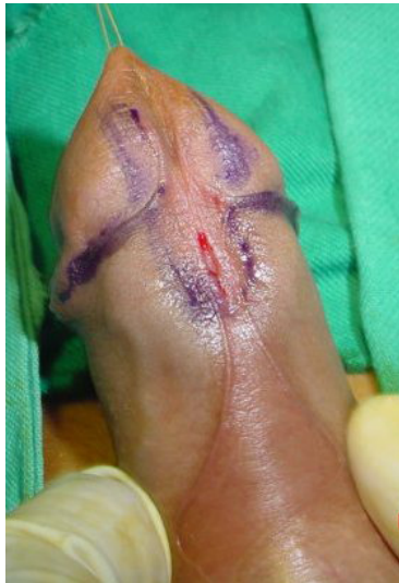
Figure 1. Two Parallel Longitudinal Marks Around the Urethral Plate (Arrows Show Well-Formed Spongial Tissue). doi: 10.3834/uij.1944-5784.2009.06.13f1

of distal and midpenile hypospadias, using the hemicorpora spongiosa as an additional cover in the Y to I maneuver.