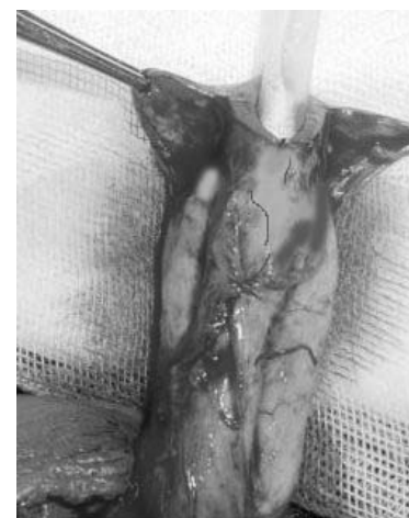
Figure 3. Approximation of the Hemicorpora to Cover the Neourethra (Y into I Maneuver). doi: 10.3834/uij.1944-5784.2009.06.13f3

Orthoplasty was performed by dorsal tunica albuginea placcation, if needed. Two parallel longitudinal incisions separated the urethral plate from the glans wings. The urethral plate was then incised in the midline from the hypospadiac meatus to the area just proximal to the glans tip. The urethral plate was then