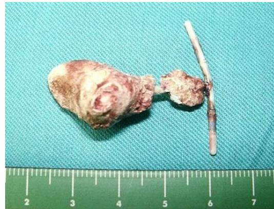
Figure 5. The IUD after extraction partially encased by a stone

IUD perforation to the bladder with or without stone formation is a rare event that can be diagnosed and treated easily with minor procedures and minimal complications in most of the cases, provided that the urologist considered this condition.