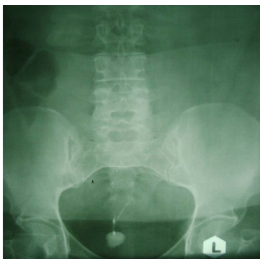
Figure 1. Plain UT Showing the Stone over the IUD doi: 10.3834/uij.1939.4810.2008.11.06.f1

A 38-year-old female presented to our facility with a history of persistent UTI for the prior 6 months and associated hematuria for the last 2 weeks. She had a long history of lower back pain and was treated for a long-term pelvic inflammatory disease with no improvement. Her history was irrelevant regarding any previous operations or concomitant diseases, but she was admitted 8 years earlier for IUD retrieval and was told it was removed. Plain UT and an IVU showed a bladder stone encasing part of an IUD lying within the urinary bladder, which was confirmed by ultrasonography (fig. 1). Cystoscopy showed a 3-cm stone attached to an intravesical IUD. This was extracted via a small suprapubic incision (fig. 2).