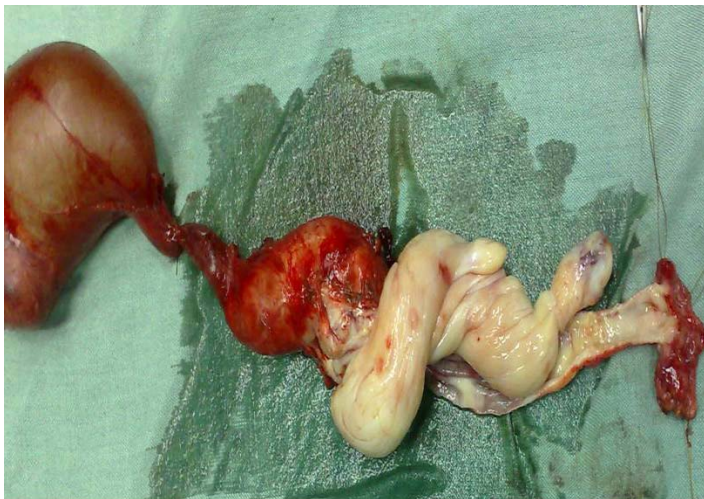
Figure 1. A nephroureterectomy specimen showing the tumor arising from the upper ureter and extending up to the ureterovesical junction. The ipsilateral kidney is hydronephrotic. The bladder cuff is also visible.