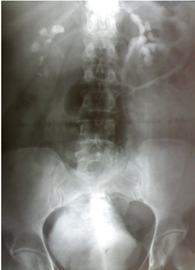
Figure 2b. Intravenous Urogram 12 Months After Surgery.

doi: 10.3834/uij.1944-5784.2009.10.02f2a