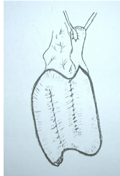
Figure 1b. Creation of the Ileal Orthotopic Bladder Substitute, Part B. doi: 10.3834/uij.1944-5784.2009.10.02f1b

The ureters were implanted in end-to-side fashion at the proximal end of the 10 cm afferent tubular segment, according to the Nesbit technique, with 6 fr ureteral stents. The distal segment was then folded transversely into an N-shaped pouch and the neighboring edges were sutured together by seromuscular continuous suture.