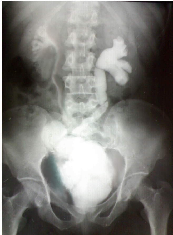
Figure 3. Postoperative Intravenous Urogram Showing Left Ureteroileal Stenosis. doi: 10.3834/uij.1944-5784.2009.10.02f3

ureteral end. The N-shaped pouch carries the advantage of an afferent isoperistaltic segment, which acts as an antireflux and allows easy anastomosis with short ureters when compared with the Hautmann pouch. The present technique is simple and less time consuming with short ureters when compared with the T-pouch. The spatulated end of the ureters is anastomosed by a direct mucosa-to-mucosa technique to the intestinal mucosa without passing in a tunnel. Accordingly, the incidence of anastomotic stricture is low (5%) when compared with serous lined extramural ureteral reimplantation [29].